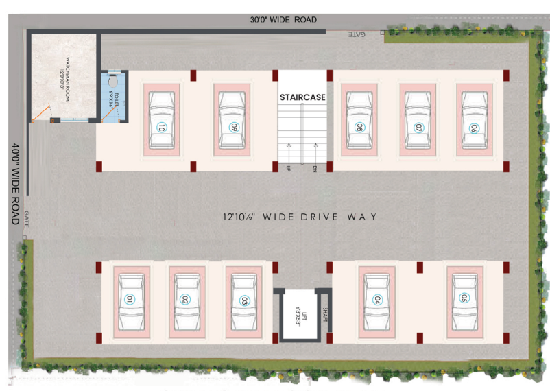
STILT ONE FLOOR PLAN